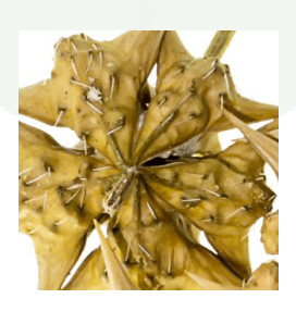
Gokshura Helps in boosting metabolism