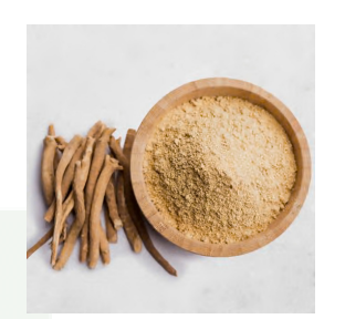
Nagori Ashwagandha 183rd day harvested with 5% withanolide content. Reduces stress levels & improves sleep quality