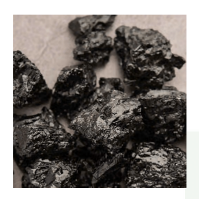
Shilajit 18000ft Himalayan Grade A Shilajit, rich in Fulvic acid (>70%)