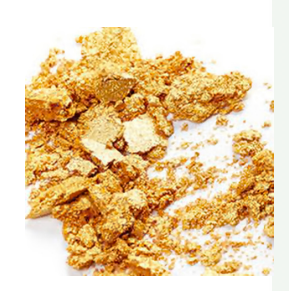
Swarna Bhasma Contains 24 Karat Gold made with special Ayurvedic Marana Process. Helps improve strength